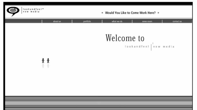
Figure 2. Two stick-figure animated characters push the screen closed to “begin” the film narrative of the Web site.

sequence for their company Web site. When visitors first arrive at this site, two small animated figures (Luke and Phil) push the “frame” or the main “screen” for the site together over the initial image of a Flash loading notice (see Figure 2).