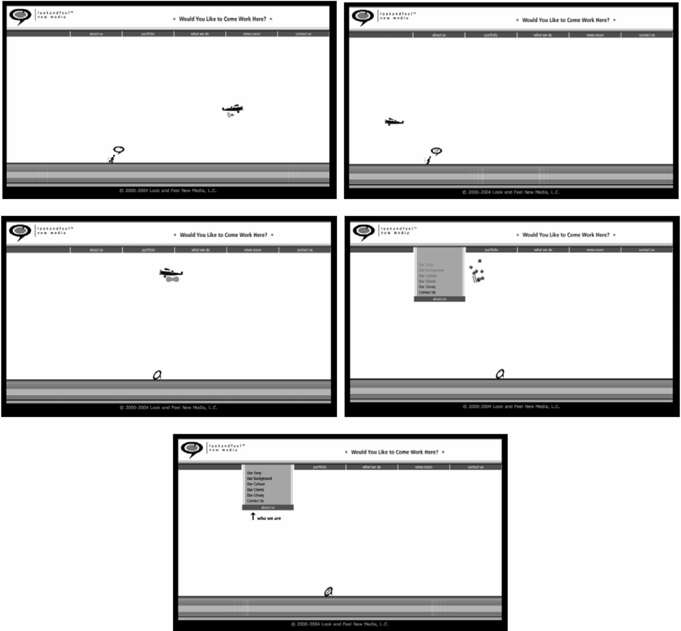
Figure 4. An animated character chases another character, steals that character’s thought balloon; the plane crashes into a dropdown menu, then plummets to the bottom of the frame. A note appears below the menu, telling the user about how the site is organized and also enticing the user to view other menus.

ory” sections of Orson Wells’ Citizen Kane , the audience watches Kane’s parents sign away their child to a rich man who seeks an heir. While watching the parents plan the child’s future, the composition arranges a window that