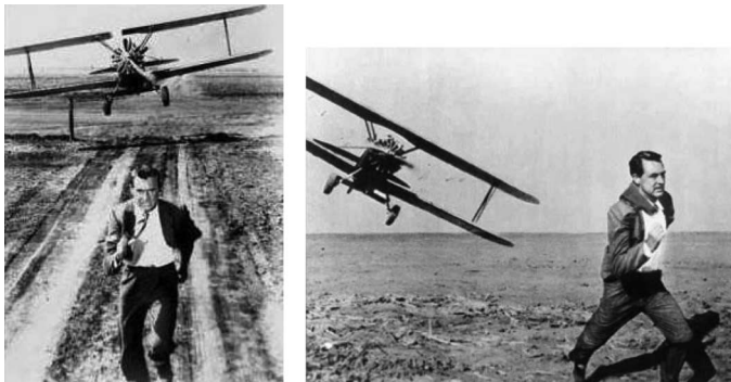
Figure 3. Cary Grant menaced by a bi-wing plane in the middle of nowhere. Scenes from Alfred Hitchcock’s North by northwest .

cock’s North by northwest in which Cary Grant is attacked by a bi-wing plane along a desolate stretch of road (see Figure 3).